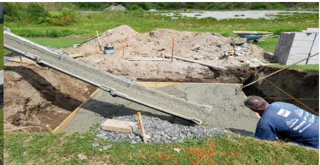
Improved floor for stability.