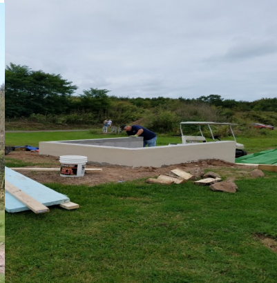
Waterproofing to make it last!