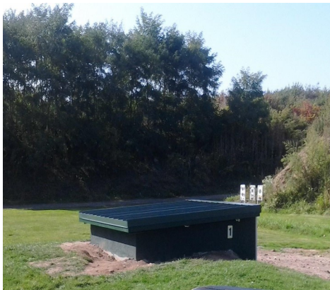
The roof fits perfectly.