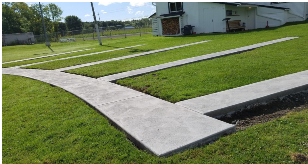
Cracked narrow walkways replaced.