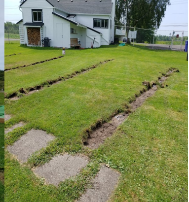
No fossils found on the dig.