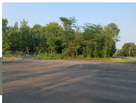
Lower Left: Parking Lot Below: Rifle