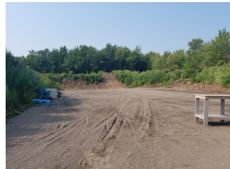
Left: West Bay Above: East Bay