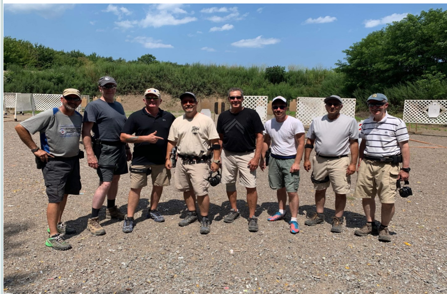
Squad 4 at the Veterans Fundraiser Match at ORGC.